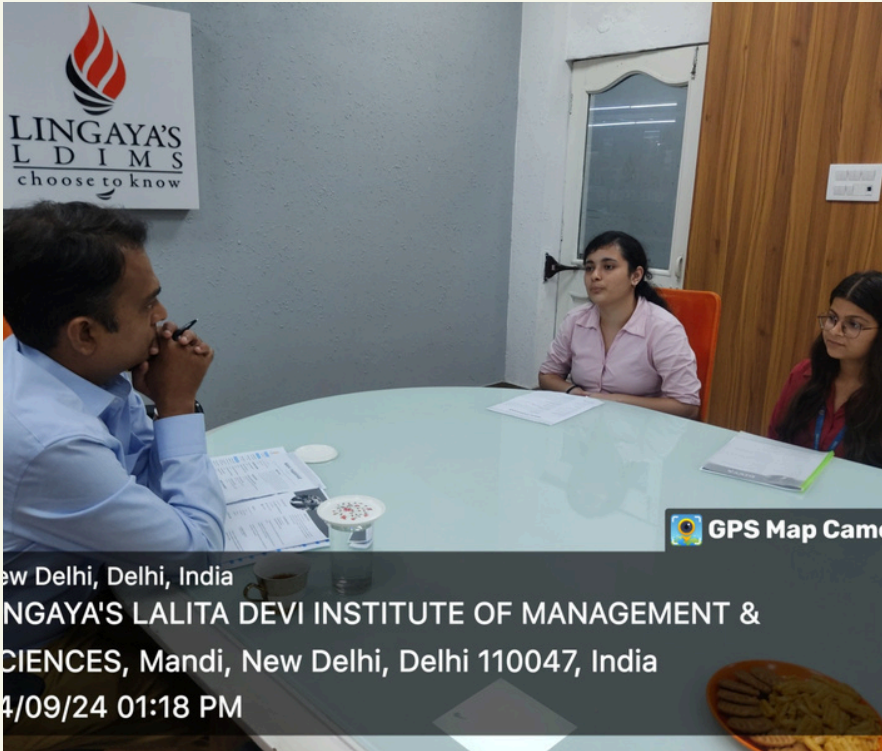
New Delhi, Delhi, India LINGAYA'S LALITA DEVI INSTITUTE OF MANAGEMENT & SCIENCES, Mandi, New Delhi, Delhi 110047, India 14/09/24 01:18 PM

A Pre-Placement Drive organized by AIMA on 20th September provided final-year B.Com students with an exceptional platform to explore career opportunities and interact with industry professionals. The event focused on equipping students with essential job-search strategies, resume-building tips, and interview techniques, thus preparing them for their professional journey.