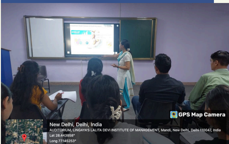
New Delhi, Delhi, India AUDITORIUM, LINGAYA'S LALITA DEVI INSTITUTE OF MANAGEMENT, Mandi, New Delhi, Delhi 110047, India Lat 28.443858° Long 77.145253° 26/09/24 10:48 AM GMT +05:30