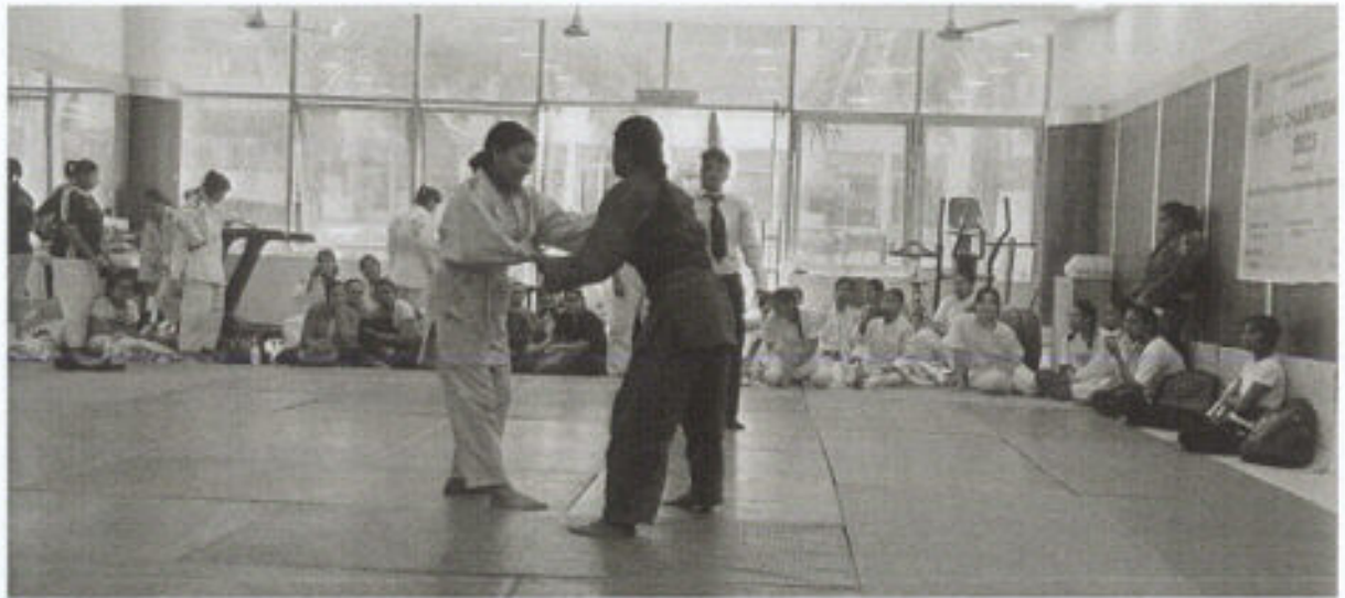
Mata sundari college sports meet