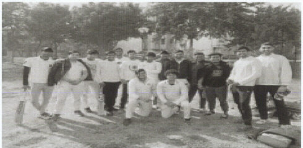
Cricket match IP University 11 th January, 2023