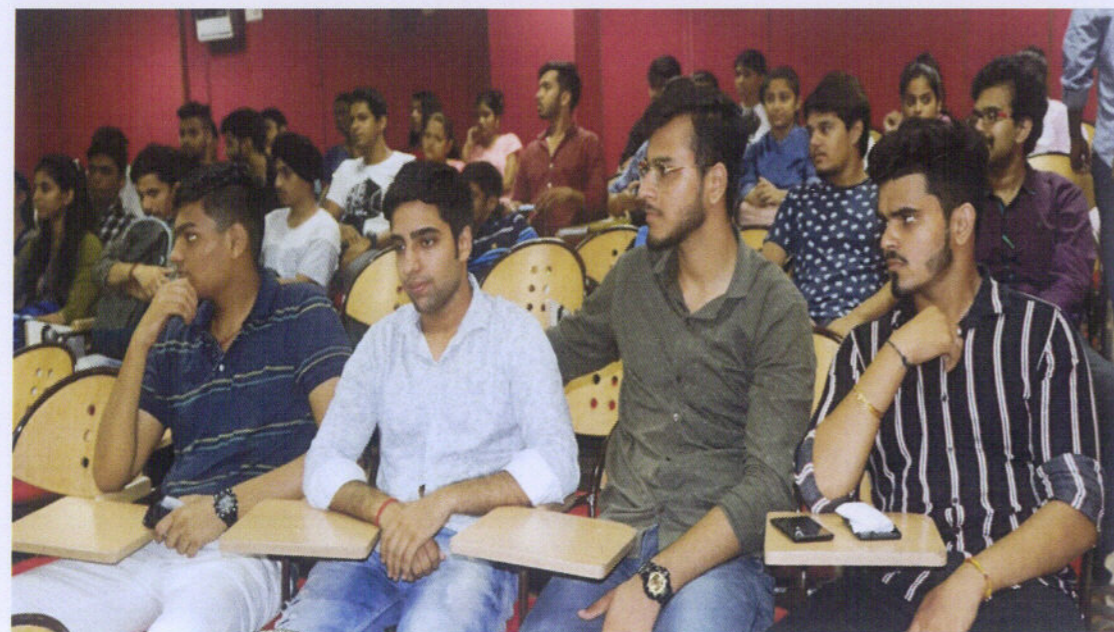
Workshop on Data Visualization 23/12/2020

On December 23, 2020, the Department of Education hosted an insightful workshop on data visualization. The event garnered significant participation, with 75 attendees eager to enhance their understanding of visualizing educational data. The workshop provided a comprehensive overview of various data visualization techniques, tools, and best practices, equipping participants with the skills to effectively communicate complex educational insights. The session not only fostered a collaborative learning environment but also facilitated discussions on the practical applications of data visualization in educational contexts. Participants left the workshop with valuable insights and a heightened ability to translate data into compelling visual narratives, empowering them to make informed decisions and drive positive educational outcomes.