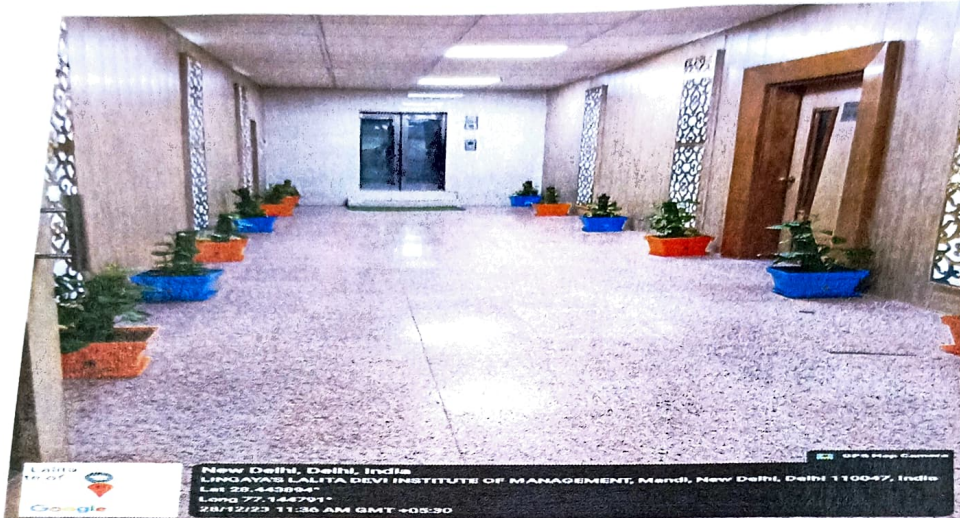
Ramp for Handicapped

Our institution prioritizes inclusivity by providing accessible facilities to students with disabilities. We have installed ramps and lifts, ensuring a barrier-free environment that promotes equal opportunities and a supportive learning experience.